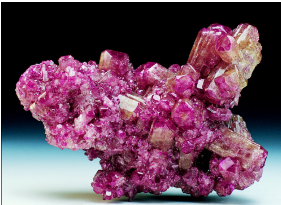
Figure 16. Cluster of "violet cup" vesuvianite, 10 cm wide, from the Jeffrey mine, Asbestos. Amabili collection; Appiani photo.