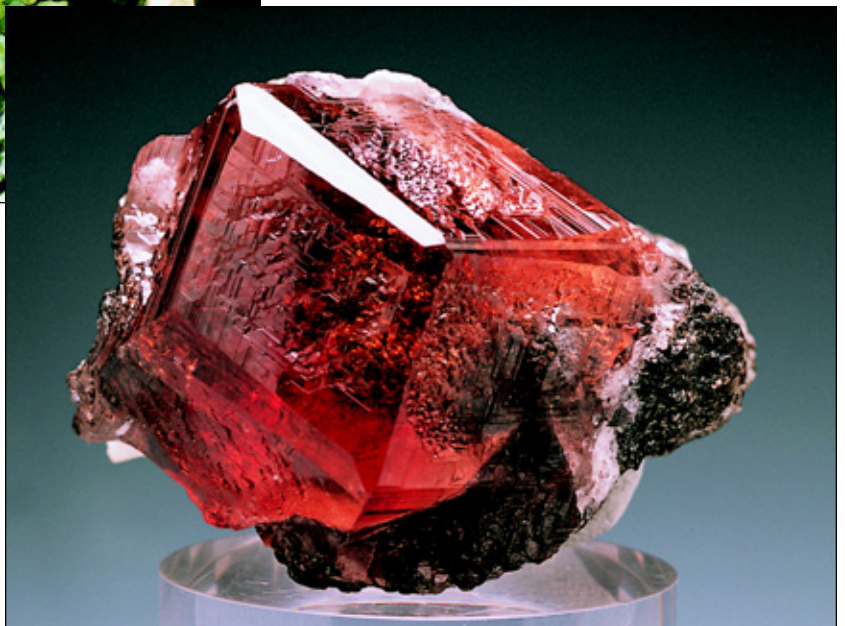
Figure 5. Huge transparent grossular crystal on matrix, 4.2 cm across, from the Jeffrey mine, Asbestos. Amabili collection; Appiani photo.