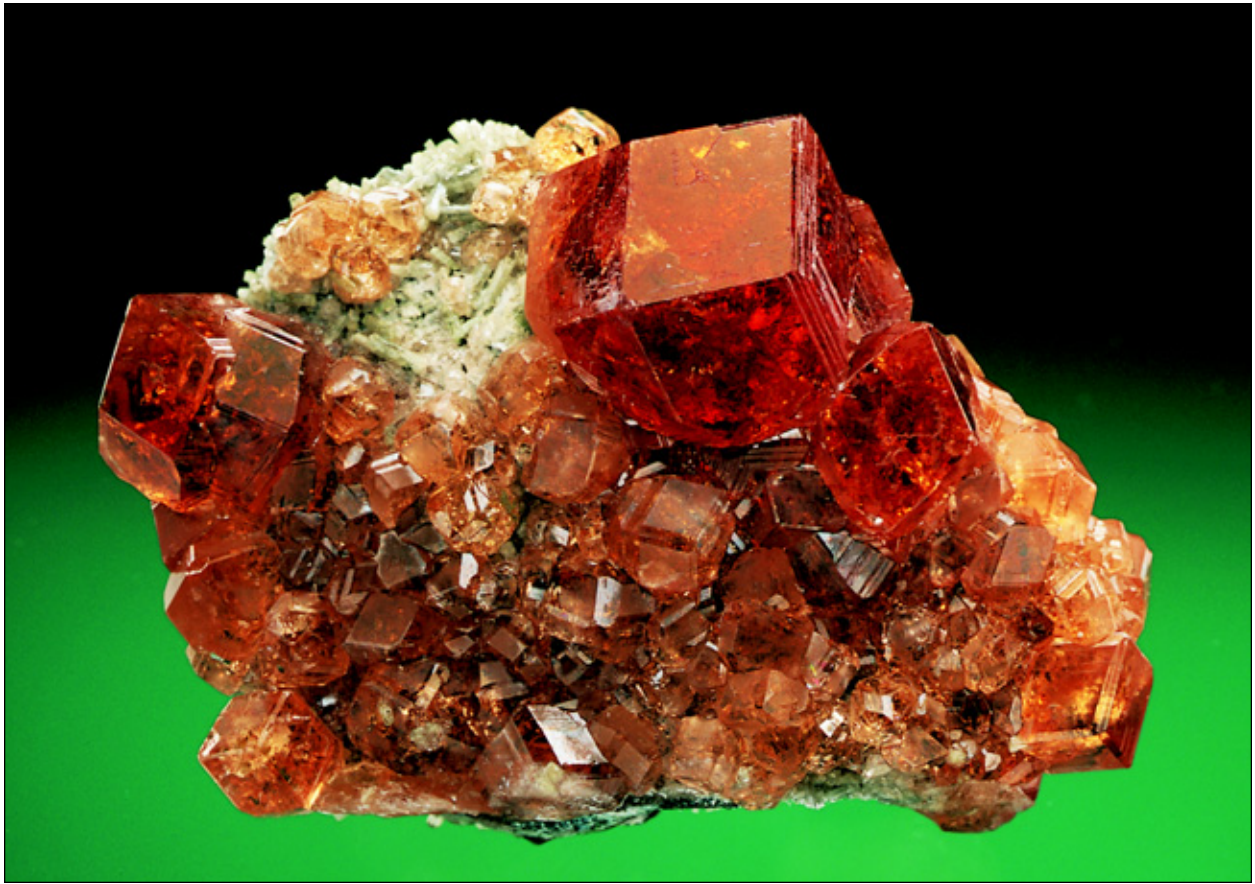
Figure 6. Grossular crystals on diopside, 6.6 cm wide (largest crystal = 2.5 cm), from the Jeffrey mine, Asbestos. Amabili collection (ex J. Levinger collection); Jeff Scovil photo.

One of the best specimens was found in the mine dumps in May of 1999, when a mineral collector cracked open a large rock containing a cavity of 17 x 40 x 50 cm lined with green diopside crystals, some with orange grossular garnet crystals perched on their terminations. This discovery has been described in the Canadian Rockhound by the lucky collector (Roy, 2002). The best specimen collected is truly outstanding: it measures 7.5 x 15 cm, and displays 14 orange garnets up to 1.4 cm individually. This specimen recently entered the collection of one of us (MA).