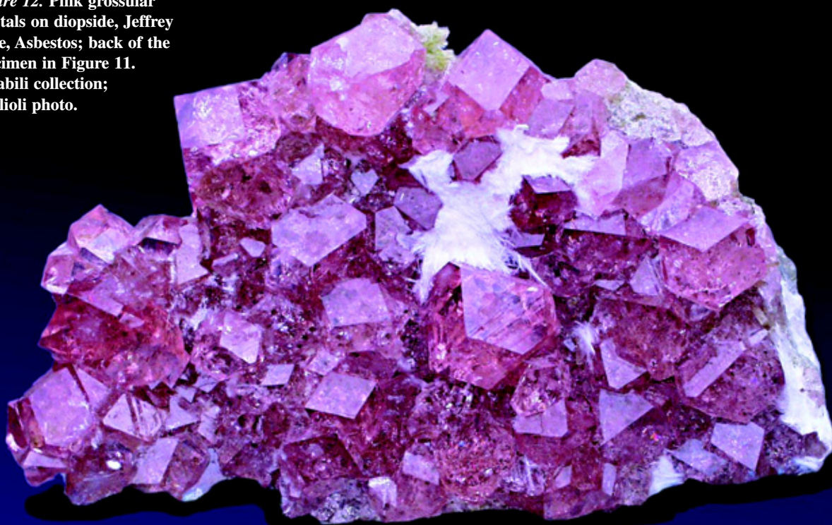
Figure 12. Pink grossular crystals on diopside, Jeffrey mine, Asbestos; back of the specimen in Figure 11. Amabili collection; Miglioli photo.