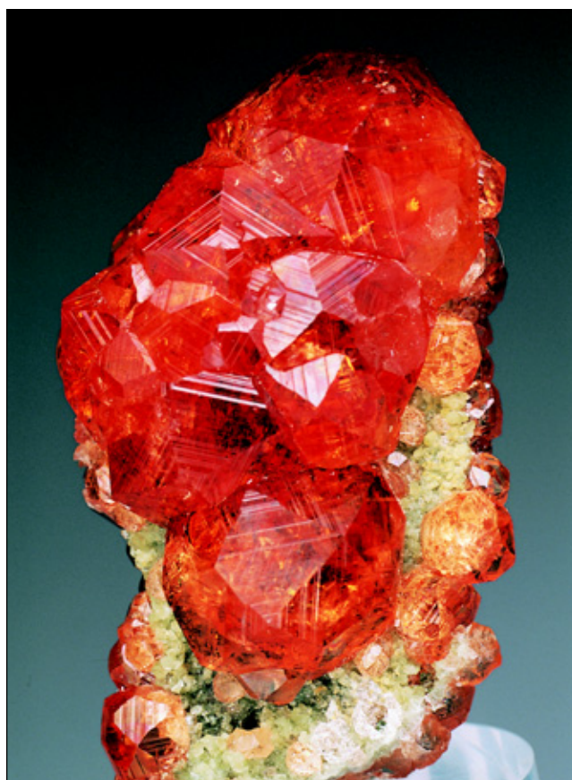
Figure 9. Grossular crystals with diopside, 5 cm tall, from the Jeffrey mine, Asbestos. Amabili collection; Appiani photo.

The excursion on August 25, 2002 proved especially lucky for