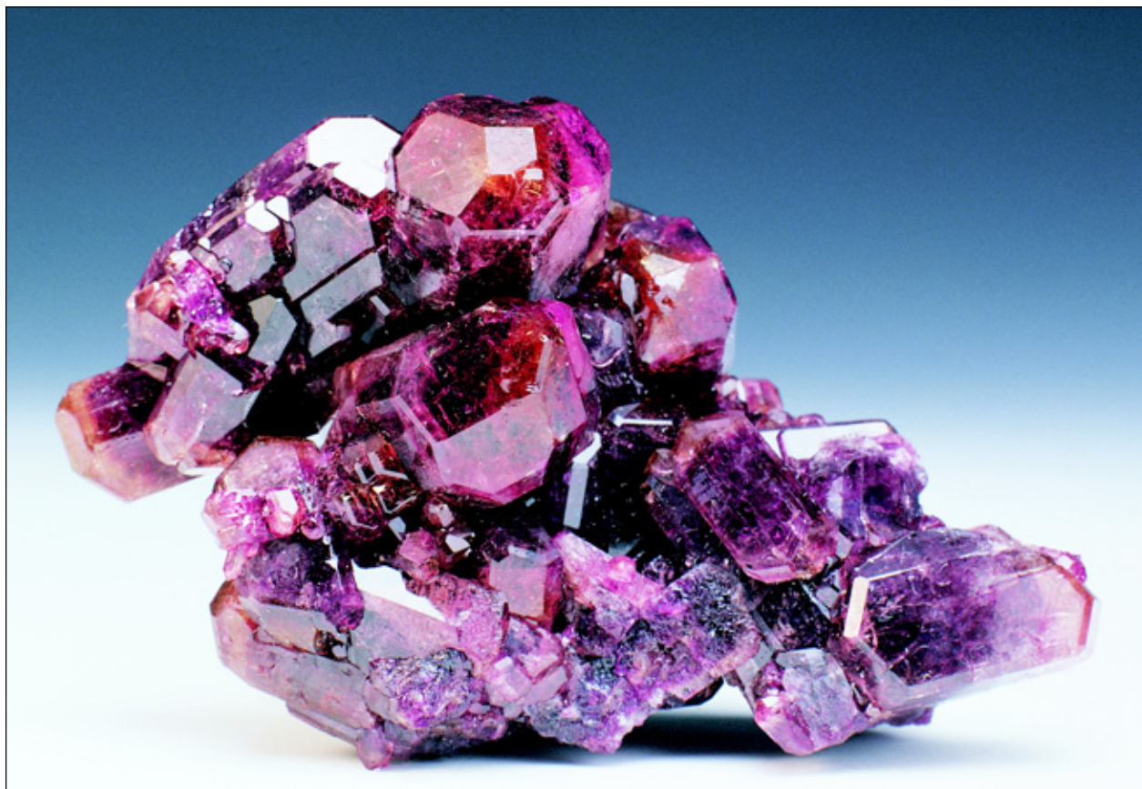
Figure 18. Deep violet vesuvianite, 6 cm, from the Jeffrey mine, Asbestos. Amabili collection; Appiani photo.