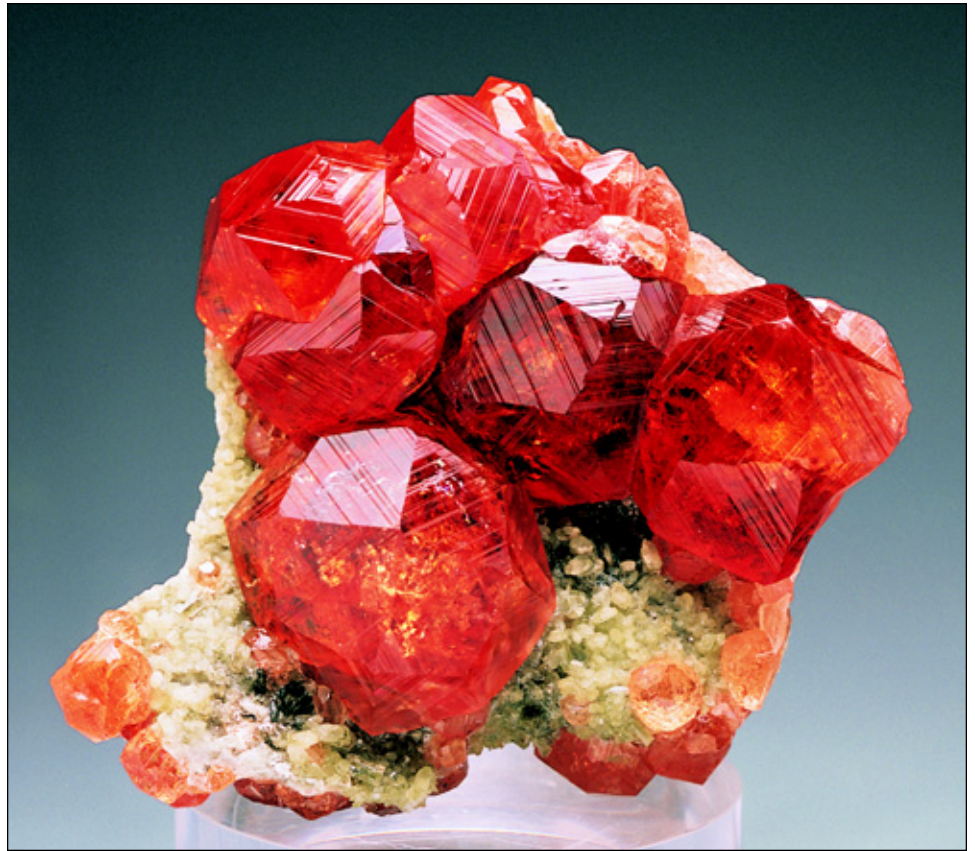
Figure 3. Grossular crystals with diopside, 4 cm, from the Jeffrey mine, Asbestos. Amabili collection; Appiani photo.