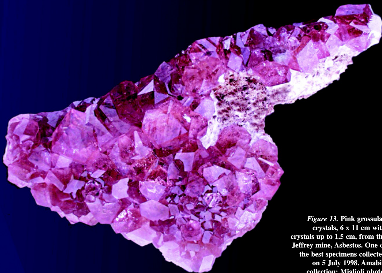
Figure 13. Pink grossular crystals, 6 x 11 cm with crystals up to 1.5 cm, from the Jeffrey mine, Asbestos. One of the best specimens collected on 5 July 1998. Amabili collection; Miglioli photo.