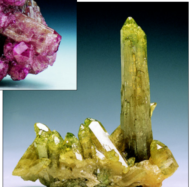
Figure 17. Green vesuvianite crystals to 4.2 cm tall, from the Jeffrey mine, Asbestos. Amabili collection; Appiani photo.