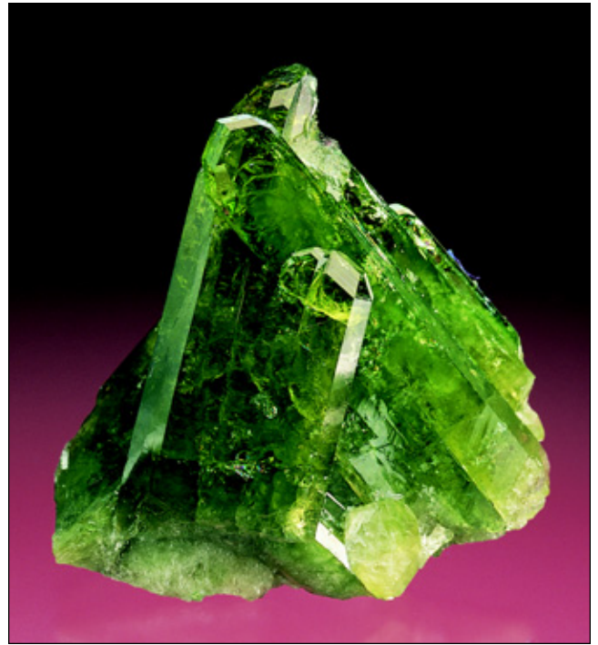
Figure 15. Emerald-green vesuvianite, 2.6 cm tall, from the Jeffrey mine, Asbestos. Amabili collection;