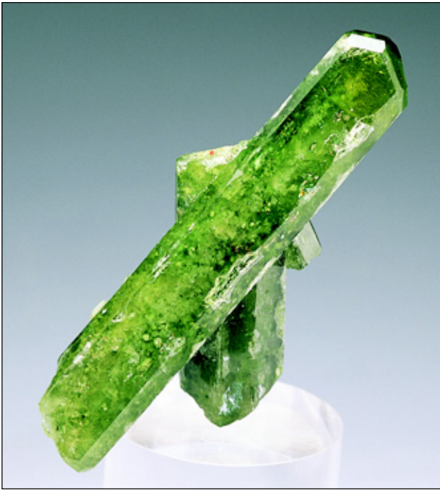
Figure 14. Emerald-green vesuvianite, 4.4 cm long, from the Jeffrey mine, Asbestos. Amabili collection; Appiani photo.