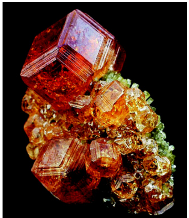
Figure 7. Grossular crystals on diopside, 5 x 7 cm from the Jeffrey mine, Asbestos. Back of the specimen shown in Figure 8. Amabili collection; Miglioli photo.

At its birth in 1994, the Club de Mineralogy d'Asbestos obtained permission from the mine management to organize six collecting excursions to the mine between May and October each year (usually on the first Sunday of the month), and during these trips in 2002 the Club found that collecting was once again good. After 2001, because of the instability of the ground in most of the pit, the collecting area was restricted to a small safe zone in the upper east portion. In 1978 and 1988 there had been some important discoveries in this zone, at the mine's former 2440 level: purple, pink, yellow and green vesuvianite crystals were found in a rodingite