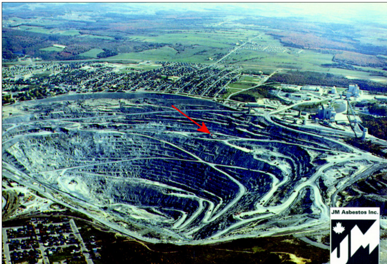
Figure 1. The Jeffrey mine in 1996. The arrow shows the location of the vesuvianite discoveries.

During the 1970's and 1980's, specimens from the Jeffrey mine were fairly abundant on the mineral market, and the mine became famous particularly for its lustrous, gemmy orange grossular crystals. Unfortunately, the market for asbestos has been in crisis for several years, and the Jeffrey mine's ore production has been greatly reduced; consequently, good mineral specimens are no longer being found in such quantities as they once were. However, a few lucky discoveries have occurred during the last few years. Specimens from these discoveries, described below, may turn out to be the last major mineral specimens which will ever emerge from this very distinctive twentieth-century locality.