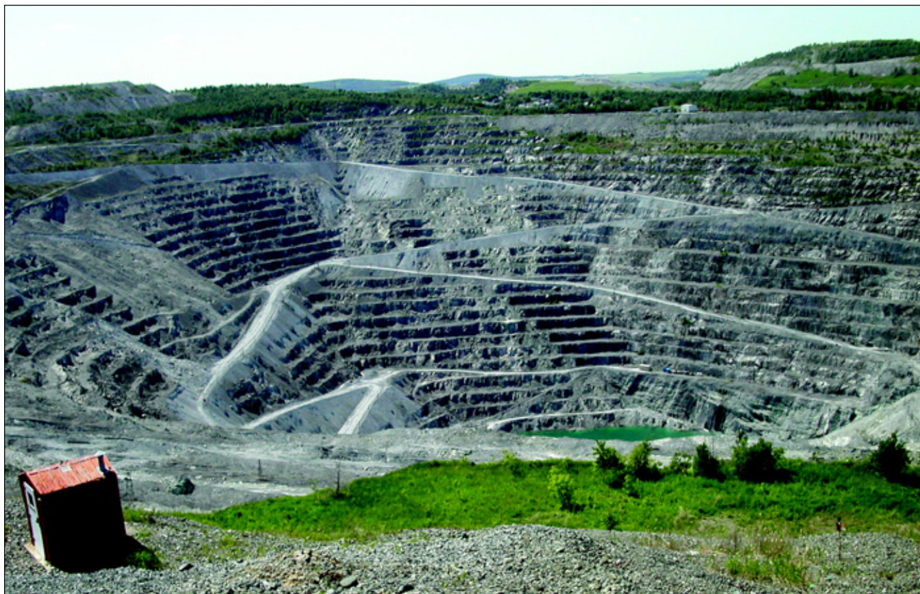
Figure 2. The Jeffrey mine in June 2003. The bottom of the pit is already flooded to a depth of about 300 feet.

miniature (3.5 cm). These are world-class specimens, crystallized all around, with gemmy rhombic-dodecahedral grossular crystals measuring up to 2.5 cm on green diopside crystals. The other specimens were sold at the 1997 Denver show and are now in important private collections.