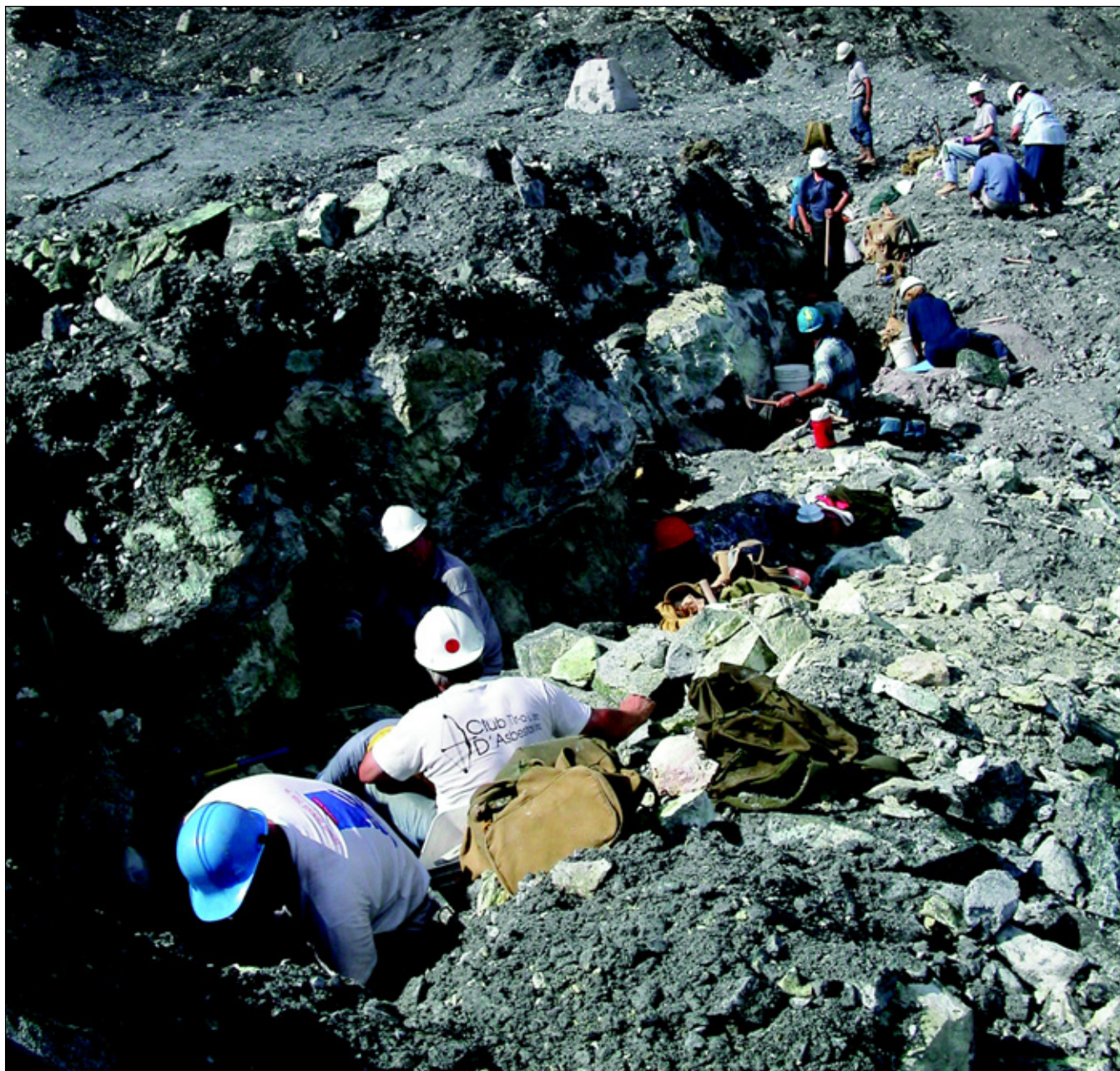
Figure 21. The location of the vesuvianite discoveries during the excursion of July 6, 2003.

scientists were admitted quite regularly and were escorted around the mine by staff members. Workers, despite being officially forbidden to collect minerals, began collecting assiduously in the 1960's, when the demand for mineral specimens (mainly grossular) created a lucrative market.