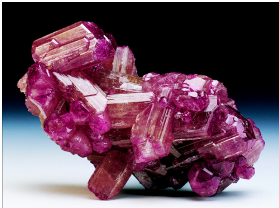
Figure 20. Cluster of “violet cup” vesuvianite, 7 cm, from Jeffrey mine, Asbestos. Amabili collection; Appiani photo.

the collecting site. A few of the specimens collected—for example, a spectacular 12.6-cm cluster of partially gemmy, purple-yellow-green vesuvianite crystals, with a very sharp 1.4 x 1.6 x 6-cm multicolored crystal with modified flat termination rising from it (MA collection)—are surely among the best vesuvianite specimens ever found at the Jeffrey mine. Prismatic, pale green vesuvianite crystals with deep purple, extremely shiny, flat terminations are classic for this locality but have always been rare—they are familiarly called “purple-cap” vesuvianite. Our favorite specimens of this type are those collected by one of us (FS) in 1978, and a few collected in September 2002, including a spectacular 8 x 10-cm specimen crystallized all around, with crystals (some doubly terminated) up to 3.4 cm, in the collection of one of us (MA).