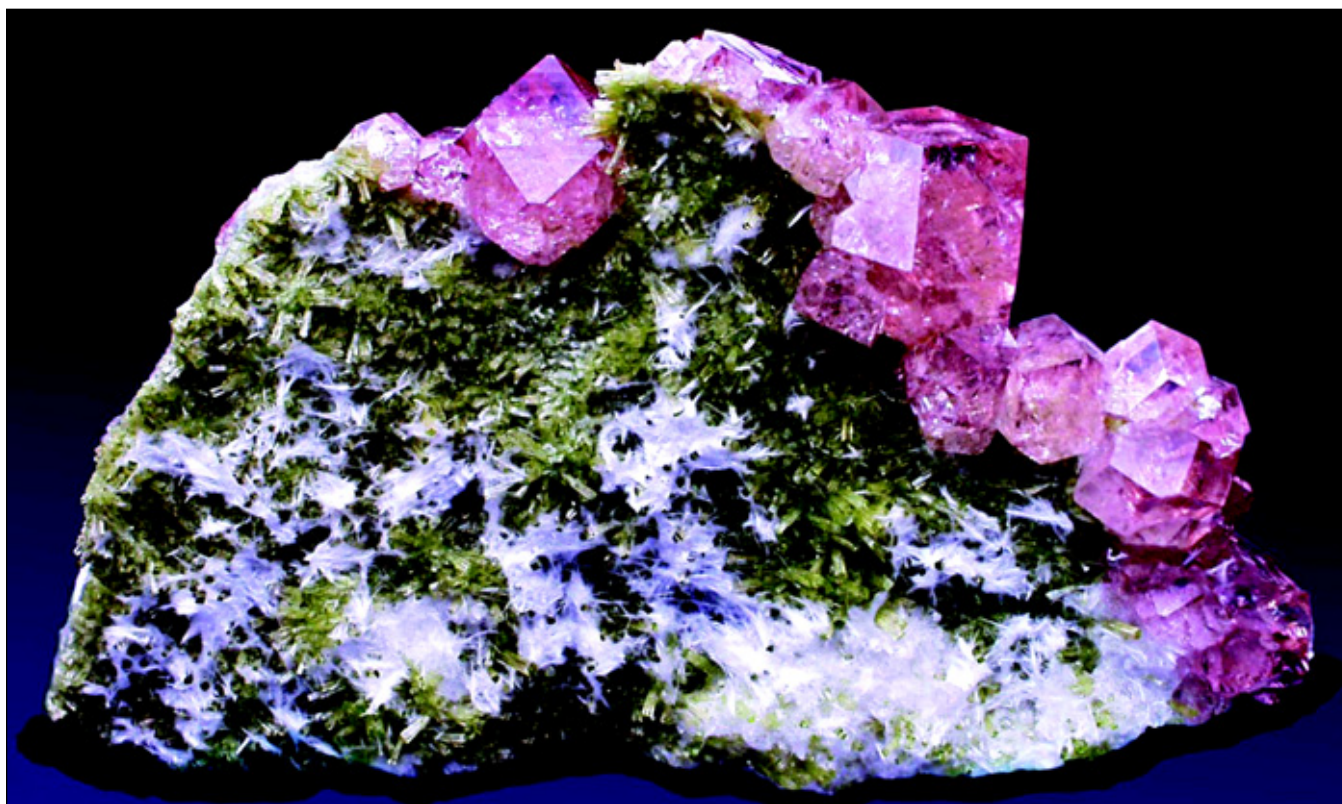
Figure 11. Pink grossular crystals on diopside, 3 x 5.5 cm with crystals up to 1 cm, from the Jeffrey mine, Asbestos. Amabili collection; Miglioli photo.

two collectors who recovered from a large pocket more than 100 specimens of yellowish green vesuvianite (some crystals having purple cores), including a cluster of doubly terminated crystals to 3 cm long and 1 cm wide individually. The specimens are of thumbnail, miniature and cabinet size; the largest measures about