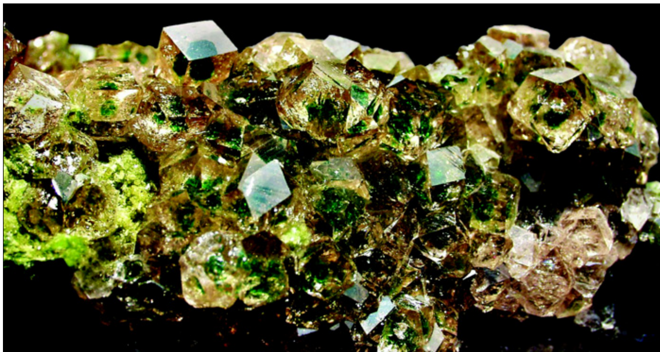
Figure 10. Transparent grossular crystals with emerald-green cores; picture area about 4 x 6 cm, from the Jeffrey mine, Asbestos. Amabili collection;