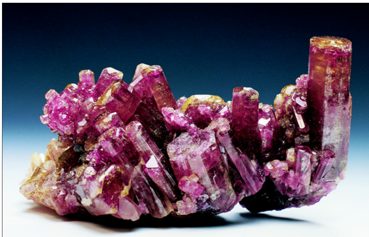
Figure 19. Multicolored vesuvianite, 12.6 cm wide, from the Jeffrey mine, Asbestos. Amabili collection; Appiani photo.