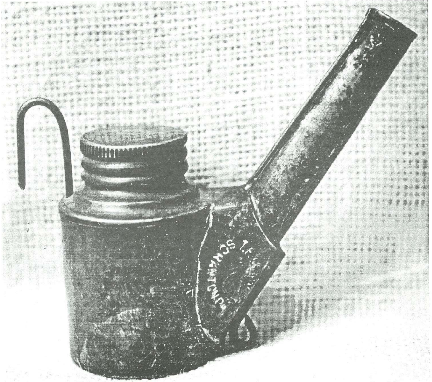
T. F. Leonard lamp.

The names of Trethaway Bros. and T. F. Leonard are commonly seen on oilwick lamps, but the two lamps pictured here, manufactured by these two firms, are very uncommon.