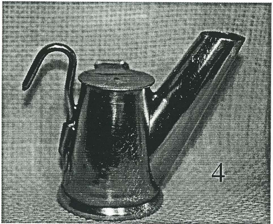
Copper face lamp with STAR stamping.

The third lamp is an all copper, with brass hook, mid-size face lamp measuring 2" tall to the top of the font cap. The double spout is 2 1/4" long. This lamp carries the simple GRIER BROS. PITTSBURG, PA stamping rather than the more common GRIER BROS. STAR in a shield stamping. As with all manufacturers, copper lamps were produced in much smaller numbers due to the higher selling cost associated with the higher material cost. Copper and brass lamps are more coveted by collectors due to both their rarity and their aesthetic appeal.