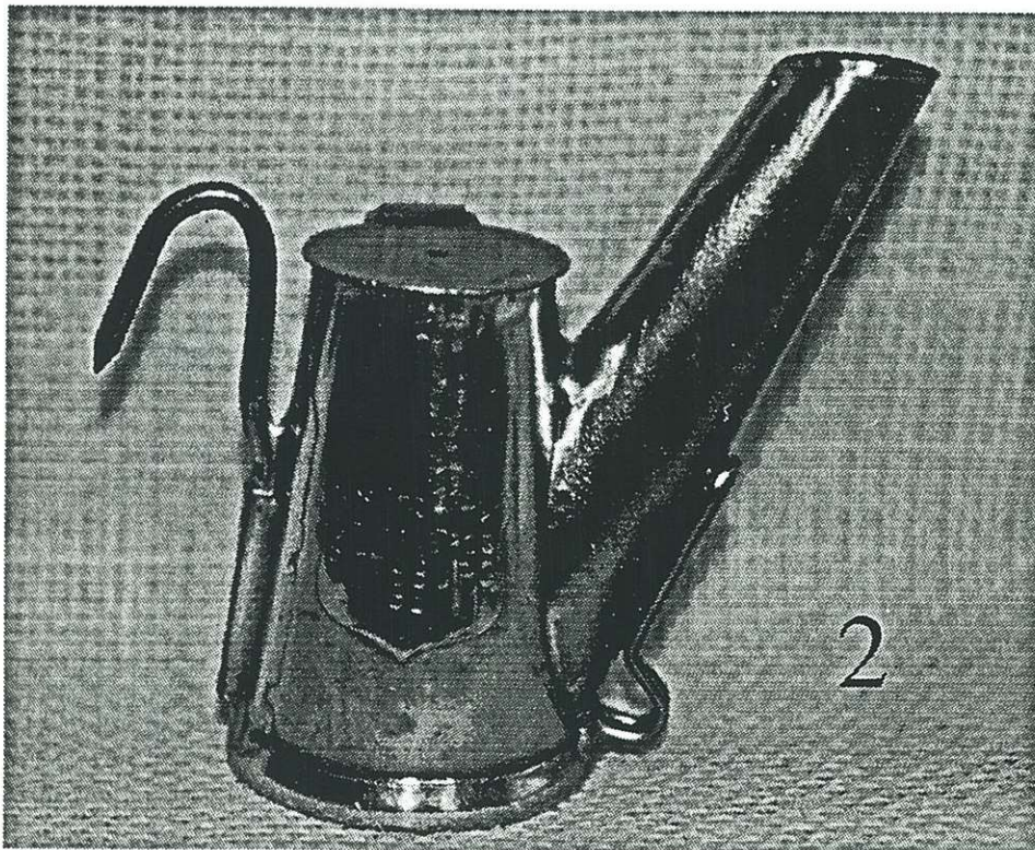
Tri-metal driver's lamp.