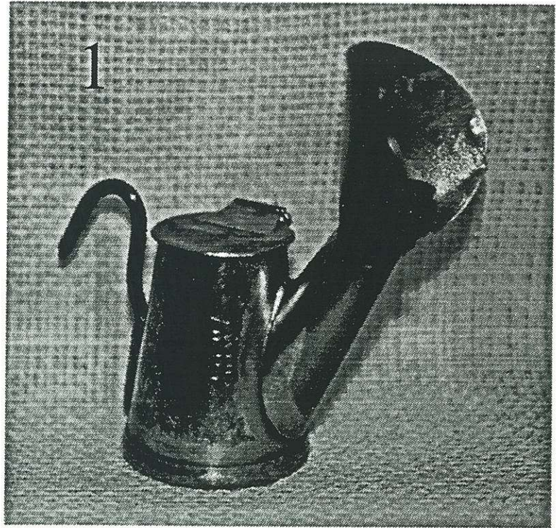
Small tin face lamp with shield.

Six other uncommon or rare oil wicks manufactured by Grier Bros. are pictured and described here. The first of these is the smallest size commonly seen Grier Bros. STAR in shield logo tin face lamp. This lamp measures 1 7/8" tall to the top