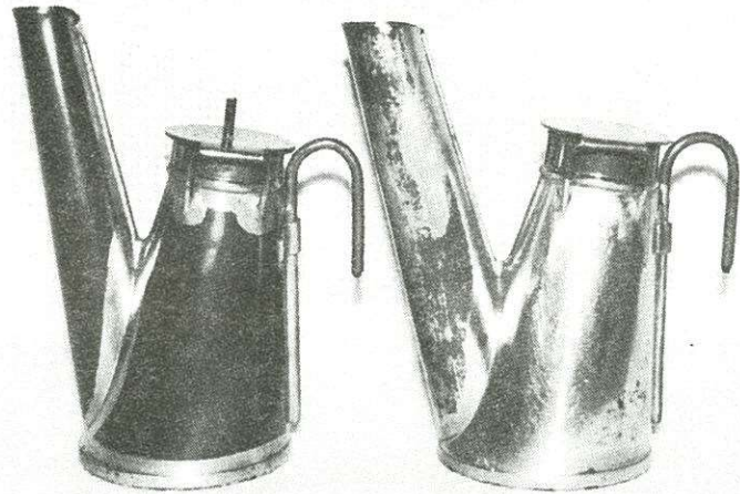
Felix style Trethaway Bros. Oil wicks