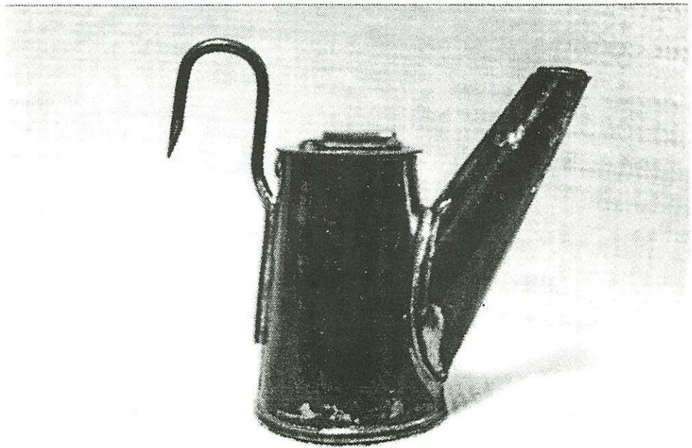
Wm. Isaac oil wick lamp.