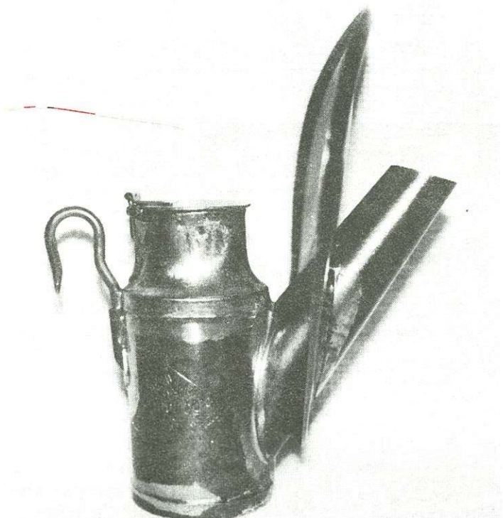
(bottom right) American Mining Tool Co. driver's lamp with large diameter spout.