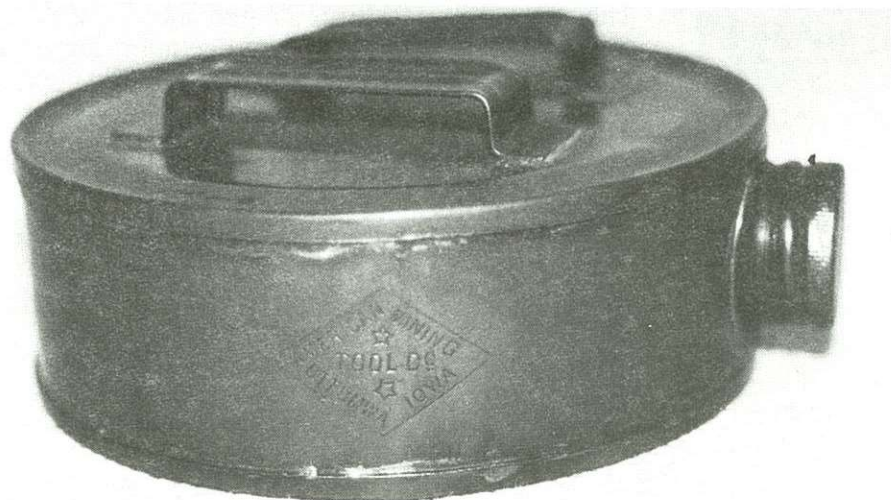
(top) Brass desk organizer promotional item.