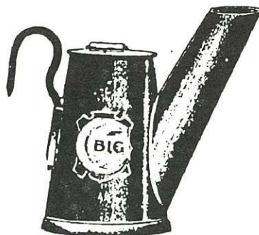
No. 3 DRIVER LAMP Double Spout Price per Gross