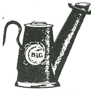
No. 61 DRIVER LAMP With Cup Spout same as No. 6 Price per Gross.