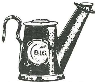
No. 21 MINER'S MEDIUM LAMP With Cup Price per Gross