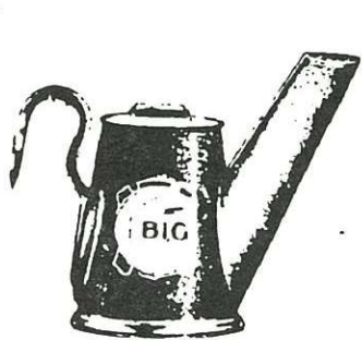
No. 2 MEDIUM SIZE LAMP Price per Gross