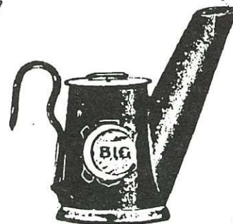
No. 4 LARGE MINER OR DRIVER LAMP Price per Gross