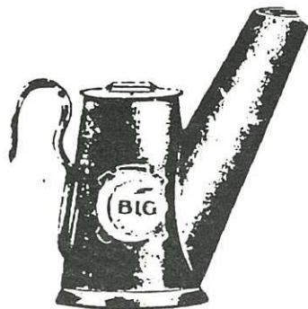
No. 6 DRIVER LAMP Double Spout Size of Spout 3 1/2 x 3/4 Price per Gross