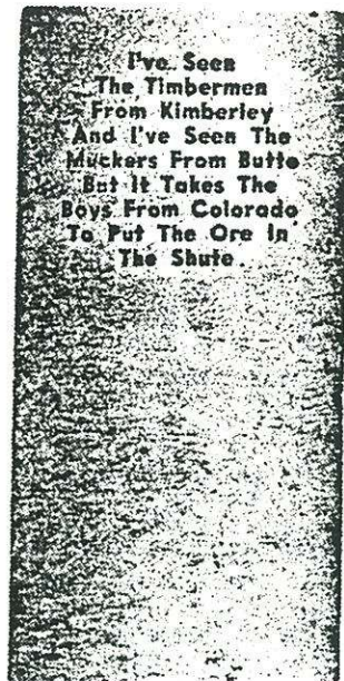
This is the inside cover of the match book. It says it all! Ha Ha.