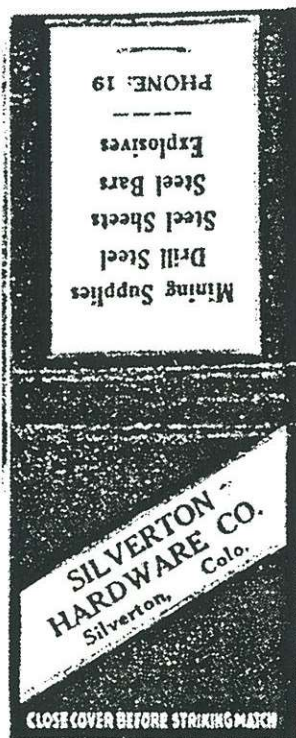
A classic mining town.