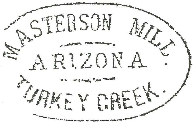
Gold bullion stamp and its impression left on a gold bar.