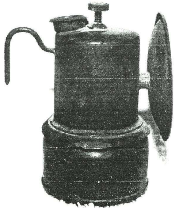
From Al Quamen's collection

Along with a page of oil wick lamps for sale in the L.H. Smith catalogue is a miners' carbide cap lamp listed by the name "ACME". Mike Puhl recalled a lamp (below) which he photographed from Al Quamen's collection which matches the lamp advertised to a tee. It is almost certainly made by the same manufacturer as the early "Victor". Evidence supporting this is the hook penetrating the tank, the number "2" stamped below the hook (Victors are found with "1" and "3" stamps), the water control knob, and the little bit of metal snipped from the tank flange. The appearance of this name in a variety catalog is reminiscent of another hardware company catalog from Philadelphia which listed the "anthracite" cap lamp as a "Britelite."