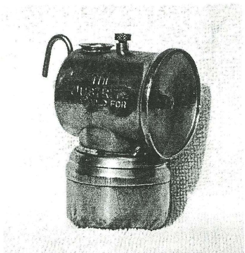
Stamped THE JUSTRITE, PAT. APPLD. FOR.