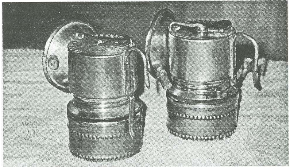
Both lamps are 'Bulldogs': They use a top-mounted water lever.