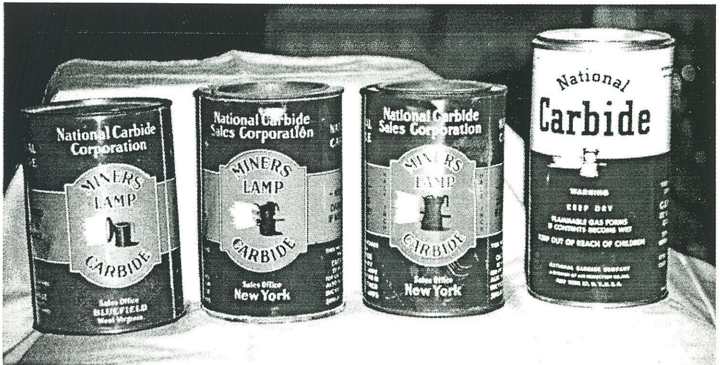
Carbide containers picturing the Standard(?), a Pocahontas(?), and Wolf cap lamps (left to right).