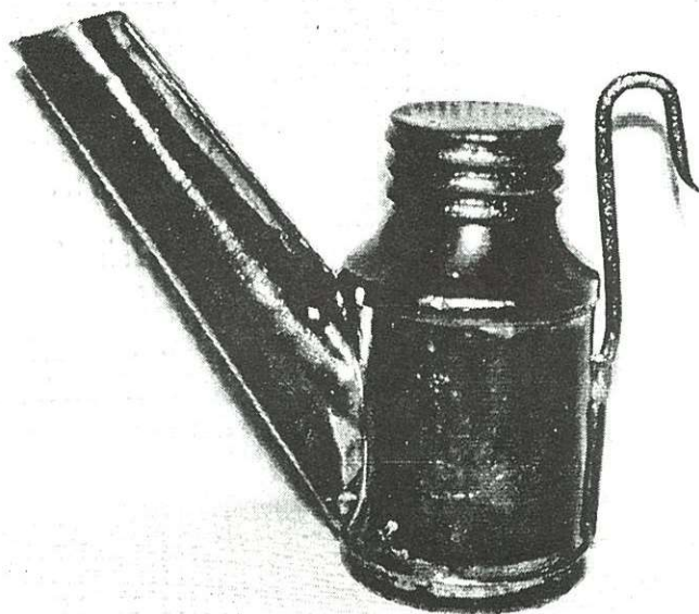
This unusual Zais lamp has straight sides and a sharply angled shoulder with a screw-on lid.

Previously known Zais products were of the classic slope-sided "Frostburg style" and "milkcan style" with flip lids. The lamp pictured here is a tin "milkcan style" with a screw lid. Does anyone else have a screw lid Zais oil wick in their collection?