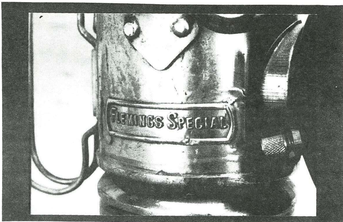
Figure 2. The name-plate tag of the "Flemings Special" that is soldered to the side of the lamp.