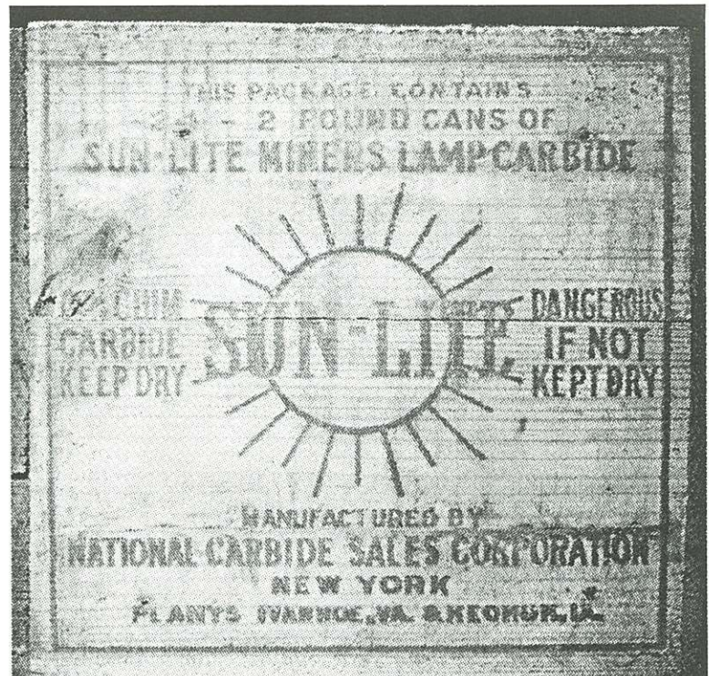
Wood shipping crate.