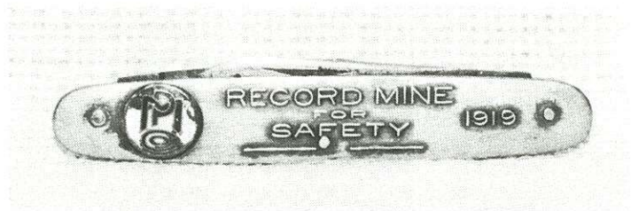
Pocket knife awarded for safety at the Cary Mine

In 1918 Pickands Mather presented a nickel-plated Justrite carbide lamp with an enamel plaque to a select group of miners in each of its mines as a reward for accident free service to the company. Each miner receiving a lamp had to have five years of consecutive accident free service, according to the son of a miner residing in Ironwood, Michigan. This man's father received one of these award lamps in 1918. In 1920 Pickands Mather presented all miners at its Cary Mine with a pocket knife safety award after the Cary Mine had the best safety record of all its mines in 1919. Each knife had the miner's name inscribed on the back.