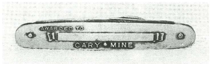
Back side of pocket knife above