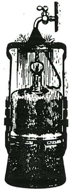
EQUIPPED WITH UMBRELLA Nos. 307, 309, 311.

Hand lamp use in the United States occurred primarily in the western states. That is, in metal mining rather than coal mining. One of the problems with the use of hand lamps in the west was the presence of water in many mines. Although the problem was not severe for the conventional design where the burner tip was horizontal, water posed a problem for hand lamps with a vertically oriented burner. Although the vertical burner arrangement is common in European hand lamps, the author is aware of only a few American companies that made hand lamps with vertical burners. The most well known example is the Justrite "Uncle Sam," an aluminum hand lamp dating from the late teens. An optional water umbrella was available for the Uncle Sam (illustrated).