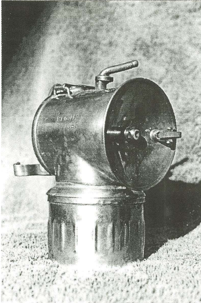
The Rex Lamp: An English copy of the horizontal Justrite. Stamping on the left side is shown below.