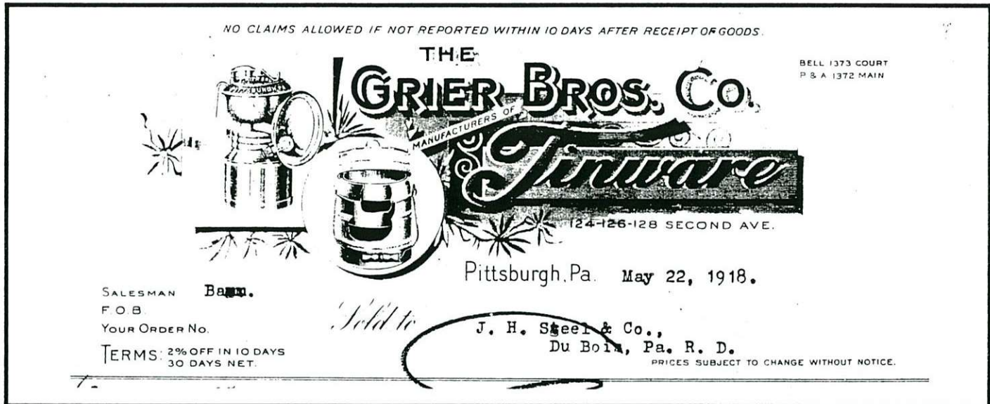
Grier letterhead from 1918