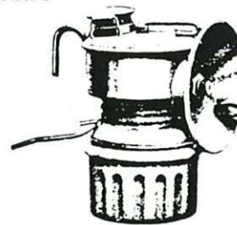
No. 28—Brass finish, 2½ in. deep brass reflector protects burner tip from dripping water.