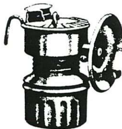
No. 5—Brass finish, 2⅞ in. brass self lighter reflector.