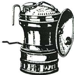
No. 102-X—Brass, 2½ in. silver nickered reflector with self lighter.