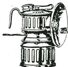
No. 661—Large Victor Lamp.