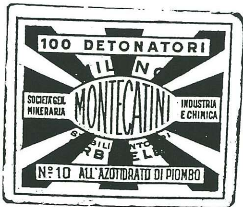
MONTECATINI, ORBETELLO, No 10 Painted red and white Reported by Alessio Grimaldi

Finally, another type of MONTECATINI tin has turned up, this one from the Orbetello factory. Alessio also reports a No. 8 strength size to both this tin and the Taino factory tin. Even though Montecatini is truly the “Du Pont of Italy,” it is almost impossible to locate any of their tins on this side of the pond.