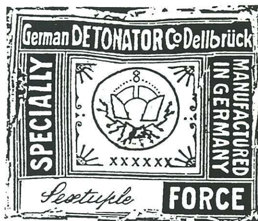
GERMAN DETONATOR, XXXXXX Blue letters on White Paper Reported by Lane Griffin