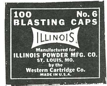
Maroon with gold lettering