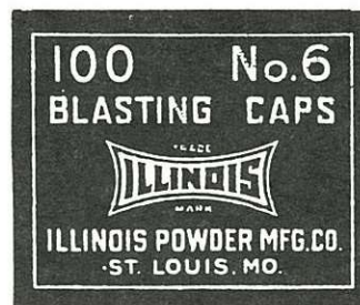
Metallic red with gold lettering