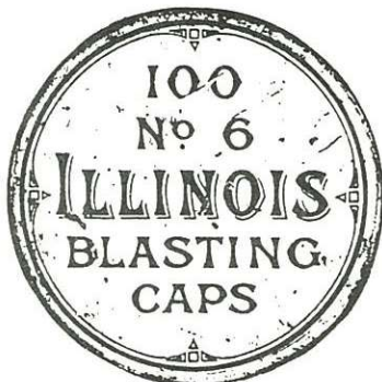
White with black lettering

There are four major styles of cap tins from this company. The two on the left are very rare while the two on the right are common.