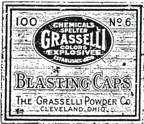
Lt. Blue, Drk. Blue, White Lettering (Ted Bobrink Collection)

No information on its length of existence is known. Shown below are the four different styles of cap tins known from the Grasselli Powder Company.