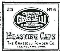
Lt. Blue, Drk. Blue, White Lettering