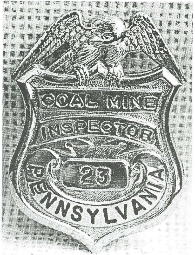
1920's - 1930's PA Coal Mine Inspector's badge.

States such as Michigan also had County Mine Inspectors who served in the same capacity as the State Inspectors.