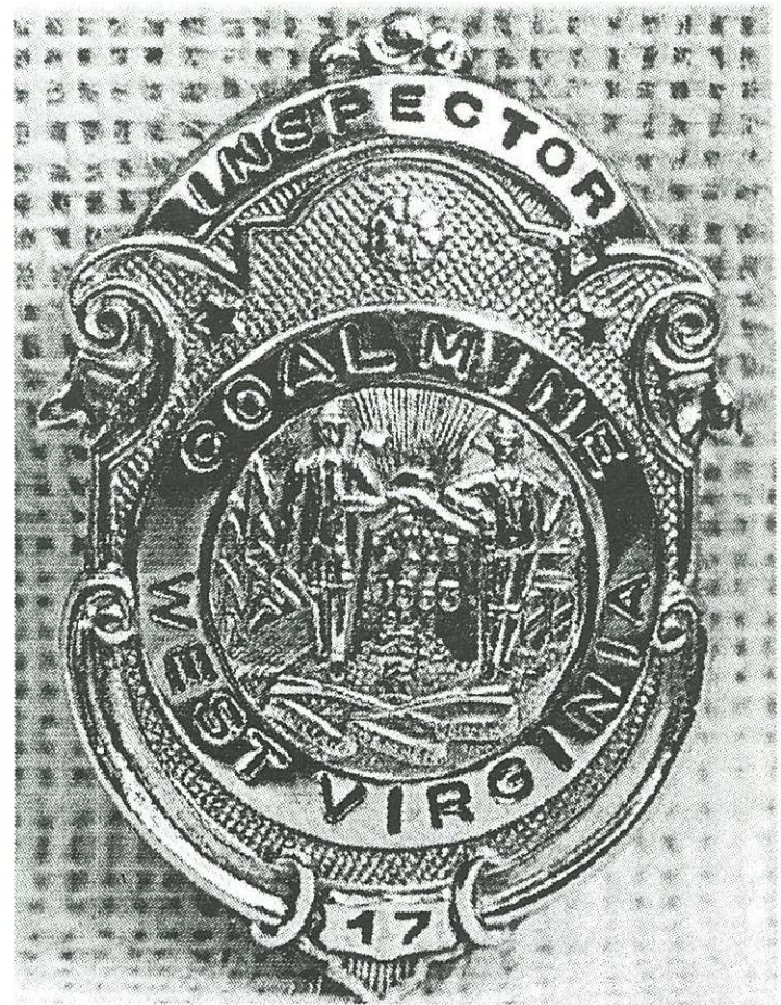
1920's - 1930's WV Coal Mine Inspector's badge.