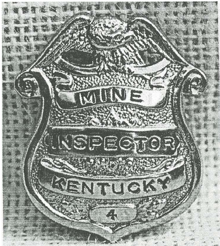
1920's - 1930's PA Coal Mine Inspector's badge.