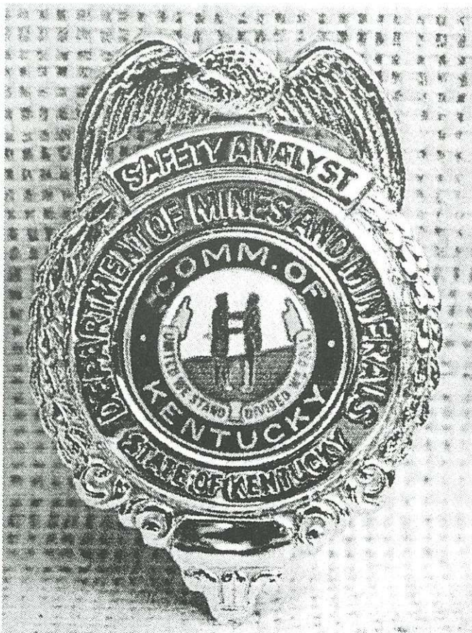
1970's KY Mine Inspector's badge.

States with mining operations passed legislation authorizing the creation of State Mine Inspectors under the auspices of such state agencies as the State Bureau of Mines, Bureau of Land Management Dept. of Mines, Dept. of Mines and Minerals and others. These State Inspectors were empowered to enforce the State mining laws, especially the safety provisions of such laws. Unfortunately in many cases the Mine Inspectors were actually in the unofficial employ of the mining companies and were paid to overlook safety violations, much to the detriment of the miners.