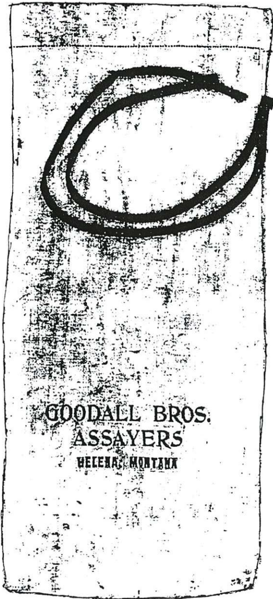
Jim Steinberg Collection

Assayer's bags were sold or given away by local assaying companies to the mines or miners they did assaying for. A prospector locating a new claim or a mining company opening up a new ore body had to take samples of their ore and have it assayed. These samples were put into small cloth bags about 14" long and 6" wide. Two sample bags are illustrated below. Most of the assayer's bags were unmarked, and the ones that were stamped with the assay company are rare and sought after by mining collectors.