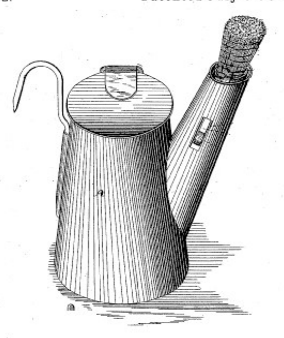
July 31, 1883 patent for a wick raising mechanism.