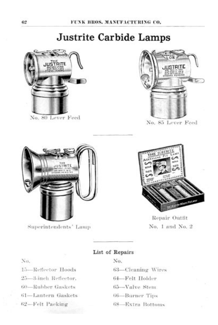
Funk Bros. Mfg. Co. catalog is penciled with a 1917 date. Pricing insert pages are also officially printed with this date, although the lamp illustrations appear to be earlier, ca. 1913.