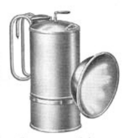
SUPERINTENDENT'S LAMP. No. 36.

American Mining Tool Company catalog shows Baldwin lamps that date to 1900–12. Oil wick lamps exist with this company's name, but to date, there is not a private label carbide lamp.