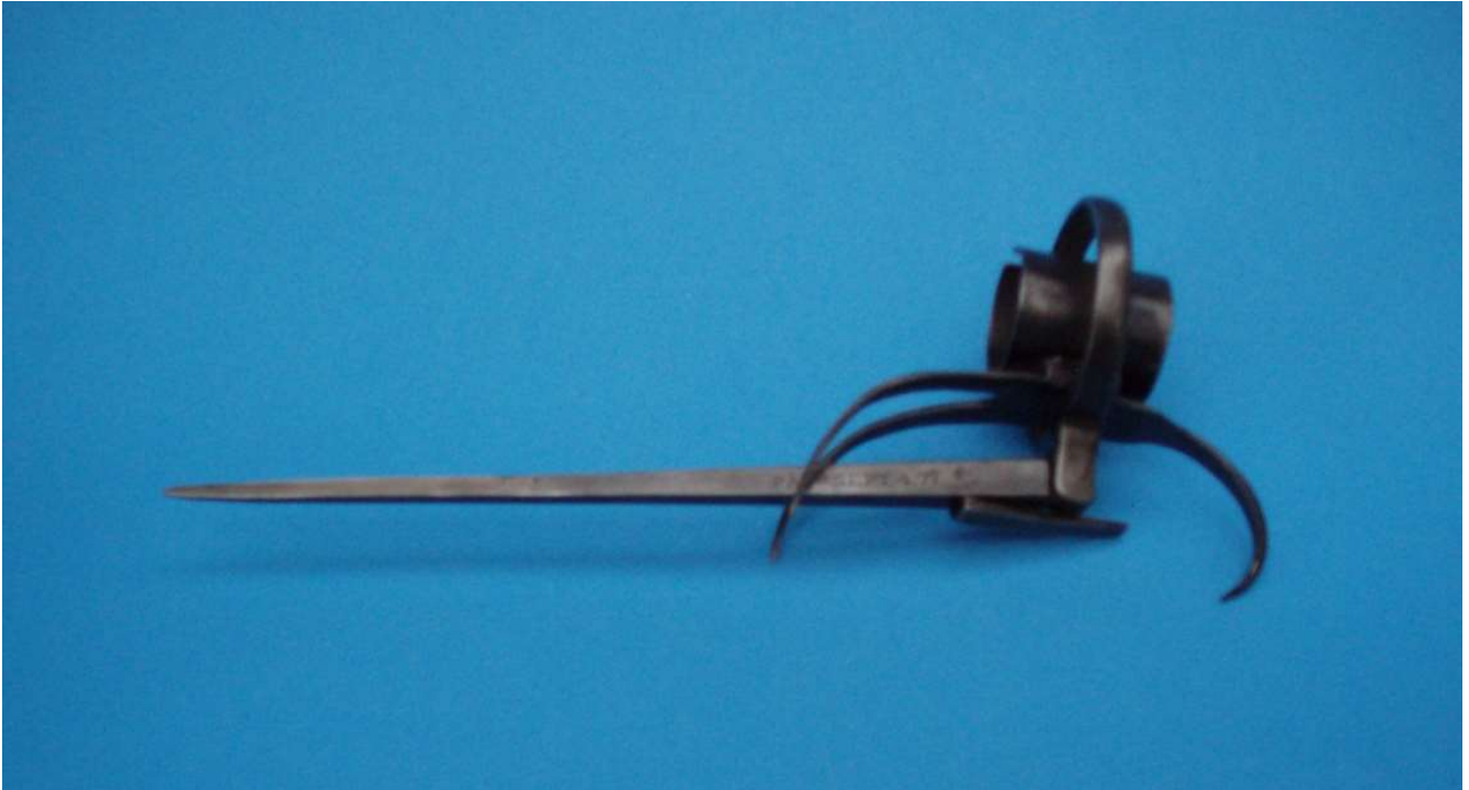
Walker candlestick folded