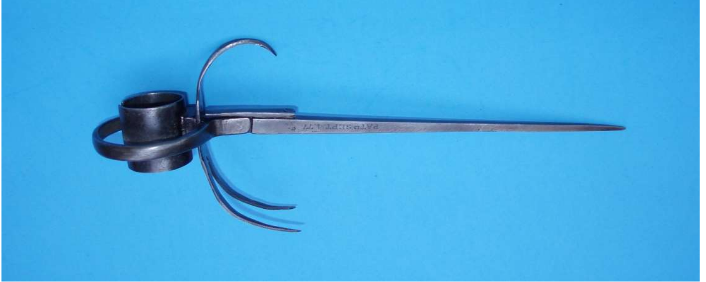
Restored Walker Candlestick. (7 inches long—6 ½ inches folded)