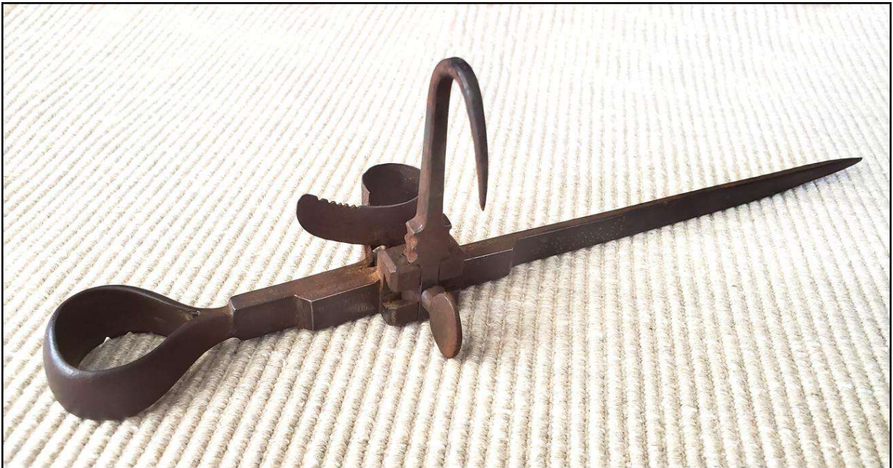
Kerckhoff patent candlestick with the removable hook in the vertical position

It is amazing to me that hitherto unknown kinds of mining artifacts continue to turn up after all this time. In fact, in the weeks right after my recent book on miners' candlesticks came off the press, I acquired not one but two candlesticks I had never seen before and had not illustrated in the book. One is the example pictured here. A candlestick that is free of any markings can be difficult to trace; however, this one has an abundance of markings which should make historical research easier.