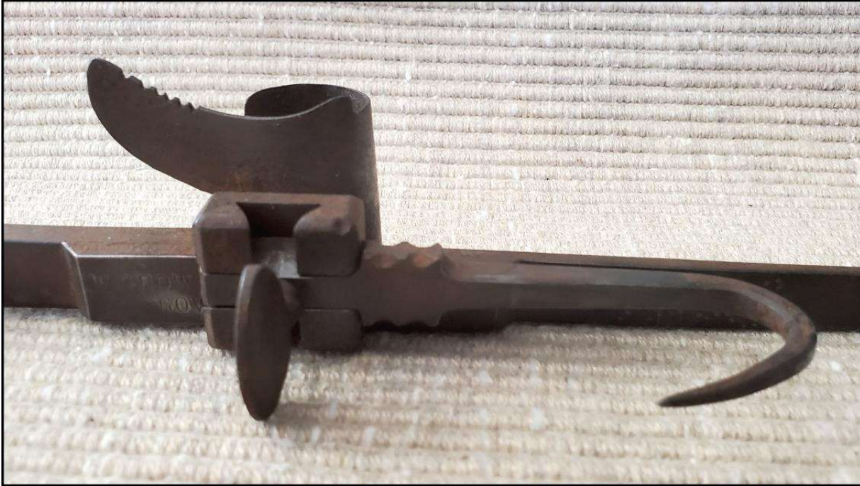
Hook stowed in the horizontal position

It is highly unlikely that “PMD” was the maker of the stick, as his signature initials are much too crude for such a skilled blacksmith.