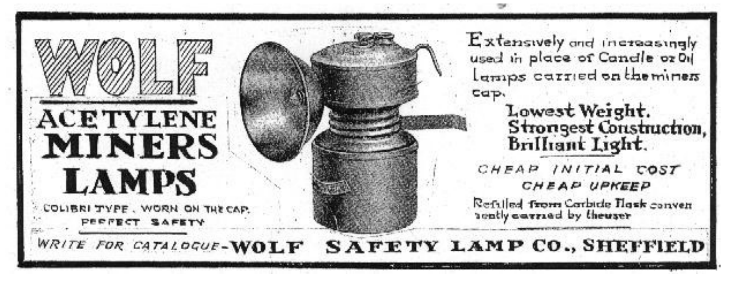
The 1914 ad showing that Wolf of Sheffield later manufactured this pattern of cap lamp.

It is interesting to relate that after the collapse of 'Wolf of Leeds' a year later in 1912, this pattern of carbide cap lamp was transferred to the new 'Wolf of Sheffield' (see 1914 advertisement below).