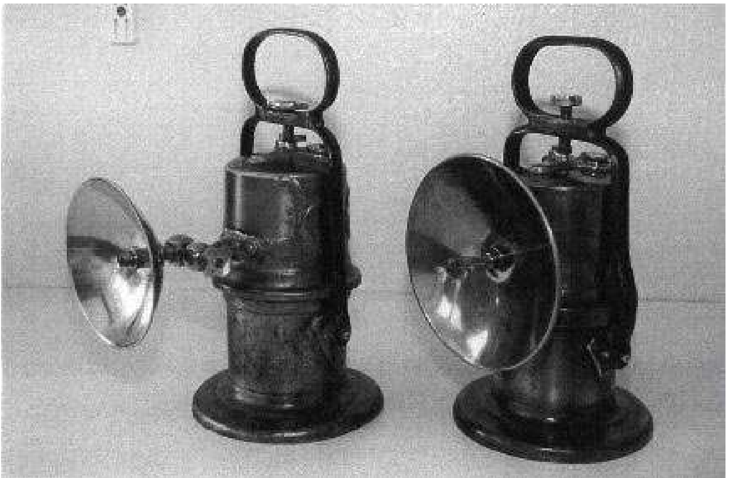
The two 'Imperial Light' lamps. (The earlier lamps on the left.)

Whilst at the recent miners lamp event held at Wilnsdorf in Germany, I was lucky enough to negotiate with the owner of the lamp in question, which led to me acquiring the lamp. Next day, whilst still at the event, I couldn't believe my eyes when across in the next row, I noticed the distinctive large size & shape of the badge on a similar looking lamp. Rushing round to the table in question I picked up what at first I thought to be a identical lamp as to the one I had purchased the day before. Closer examination revealed several differences, those in the badge being the most important. This gave the sole manufacturer of the lamp to be 'Imperial Light Ltd.', i.e. with no mention of 'Allen Liversidge'. I instantly purchased this second lamp, and was soon sat behind my table comparing the differences.