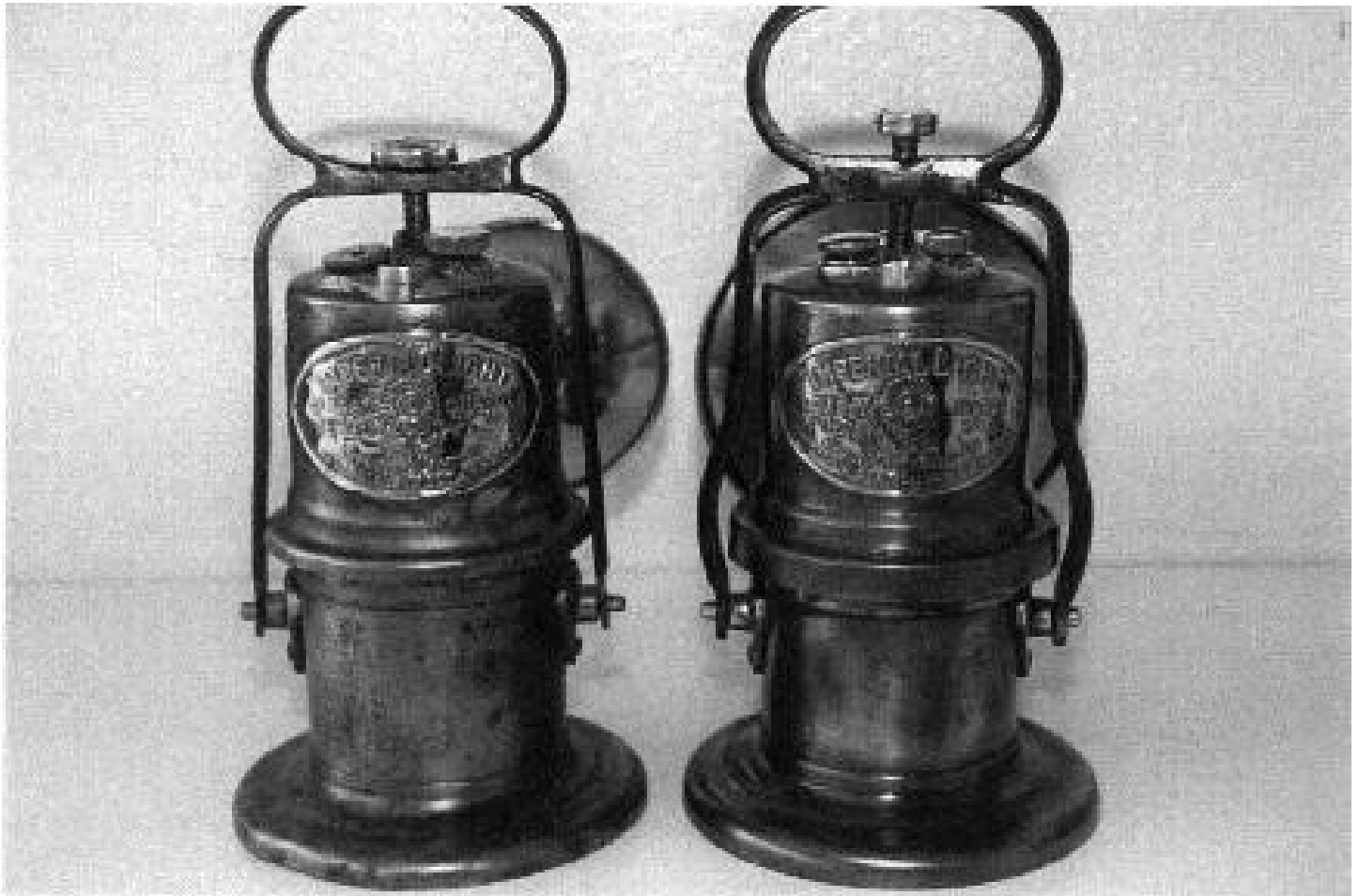
A view of the two elaborate badges. The lamps are 29.5 cm tall.

This second lamp was in a fairly poor condition having had several solder and plated repairs made to the body of the lamp, and it generally looked the older of the two lamps. The cast bridal was thinner & of a more basic shape, the skirt rim on the bottom of the water tank was thinner, the brass water door, water control tap and thumb screw nut were all of a more elaborate design. The outstanding feature of this second lamp was its gas feed pipe which was a heavy polished cast brass pipe having a universal coupling with a large position lock nut for setting the angle of the brass reflector & jet. The first lamp, ( which is in excellent condition ), has a slightly larger polished chromed steel reflector & is fitted with a double burner fishtail jet. Both embossed brass badges are of the same very large size, 10 x 6 cm. ), & show - Patent 'Imperial Light' across the top, underneath which is the company flowerhead logo. The earlier lamp states that it is a class 'Z' along with its serial No., whilst the later pattern lamp states it to be a class 'Y' also along with its serial No. Both lamps then show its charge to be 3/4 lb. of carbide. The early pattern lamp then gives the same company name & the address as Victoria Street - London, whilst the later style lamp shows 'Allen Liversidge' - Victoria Station House - London.