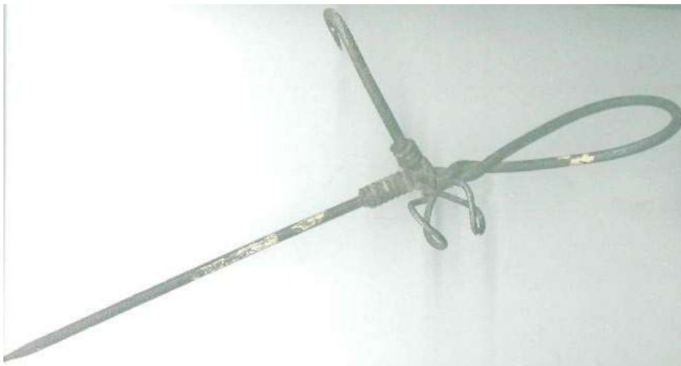
Packer patented wire candlestick.

Certainly more collectible, but never found underground are manufactured/patented candlesticks, of which the photo below illustrates. This stick was patented by Edson W. Packer in 1904. This stick was found in Idaho, where the stick was patented (Mace, Idaho Patent No. 760,398).